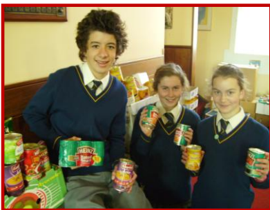
Ballarat Grammar students with some of the 3,500 cans collected.